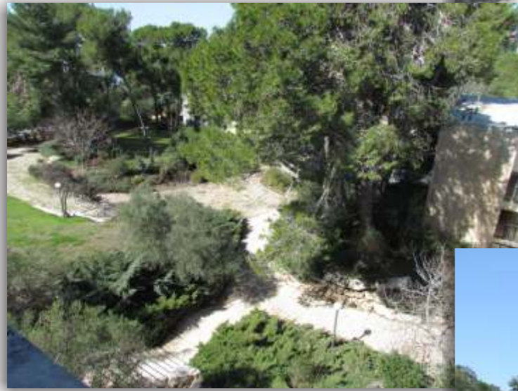
North section (elevated view)