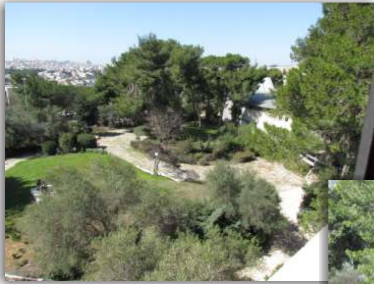
South section (elevated view)