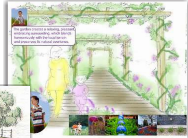
10 Flowers Arcade