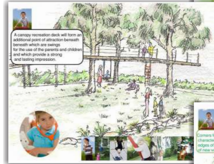
Elevated Viewing Platform