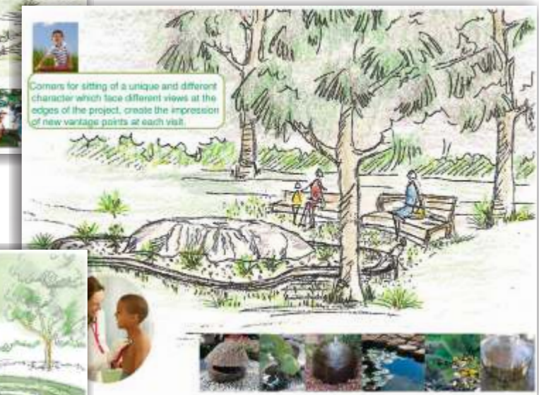
2 Water and Stone Channel