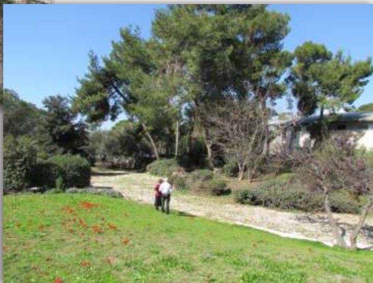
South section (looking north)